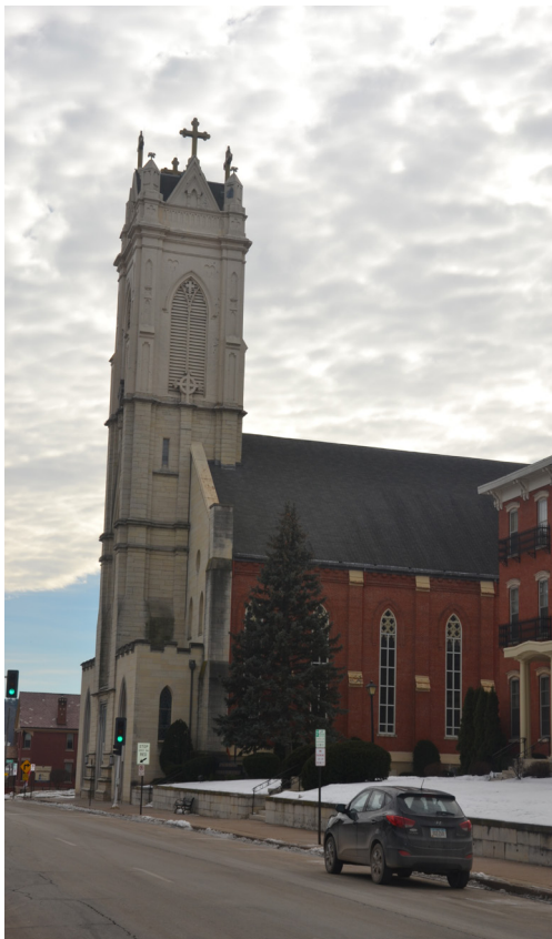
St. Raphael Cathedral in Dubuque (above) has hosted an active Catholic community of faith for over 165 years. The first Mass in the building as we know it today was held in 1857.

Thinking back to the first Catholics who celebrated in the Cathedral highlights the significance that it had to the community